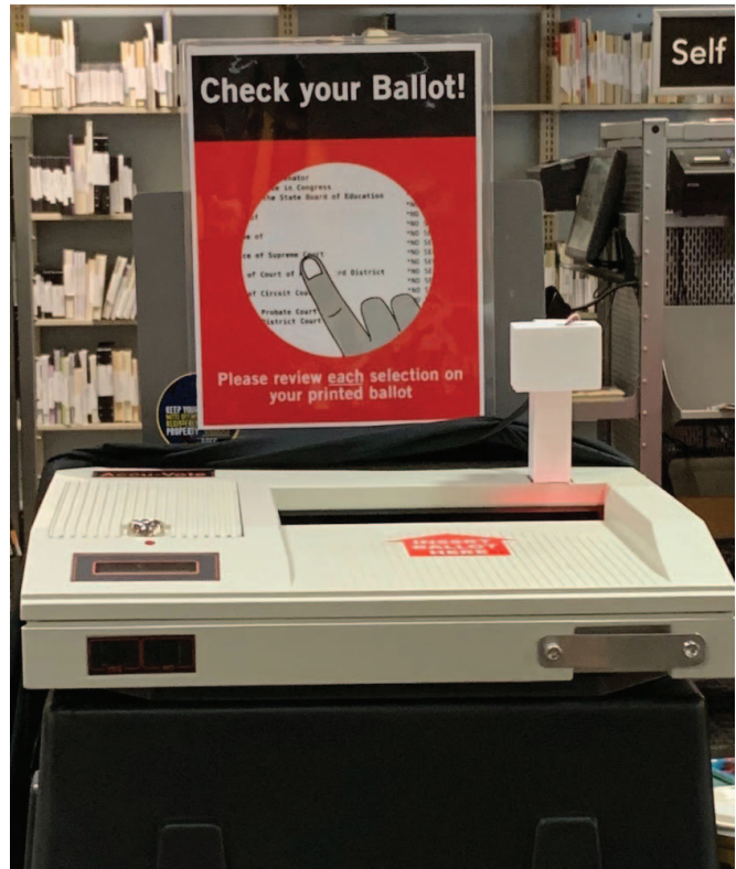
Fig. 3: Warning Signage . One of the interventions we tested was placing a sign above the scanner that instructed voters to verify their ballots. Signage was not an effective intervention.

Figure 3. We designed the sign following guidelines from the U.S. Election Assistance Commission [55].