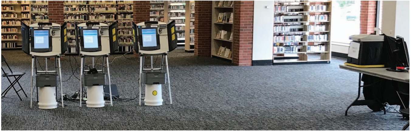
Fig. 1: Polling Place Setup . We established mock polling places at two public libraries in Ann Arbor, Michigan, with three BMDs (left) and an optical scanner and ballot box (right). Library visitors were invited to participate in a study about a new kind of election technology. The BMDs were DRE voting machines that we modified to function as malicious ballot marking devices.

on how to use the equipment, but they were not alerted that the study concerned security or that the BMDs might malfunction.