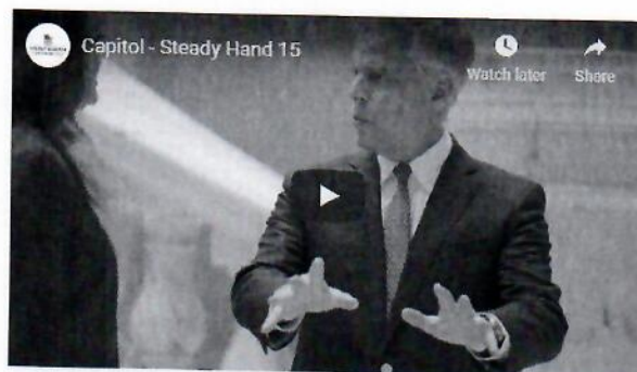
Capitol - Steady Hand