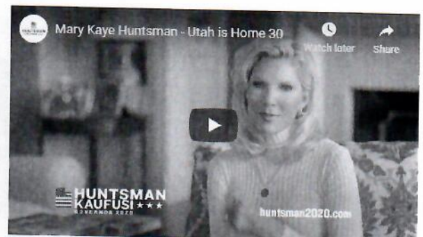
Utah Is Home