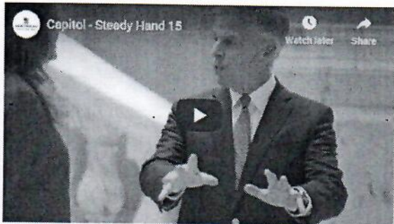
Capitol - Steady Hand