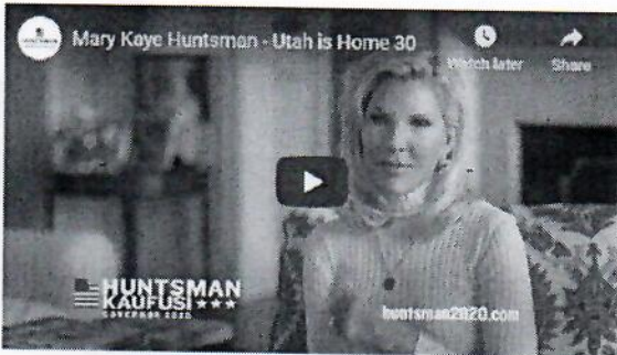
Utah Is Home